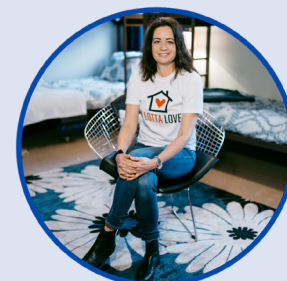
A LOTTA LOVE

2019 James T. Hewitt Distinguished Service Award